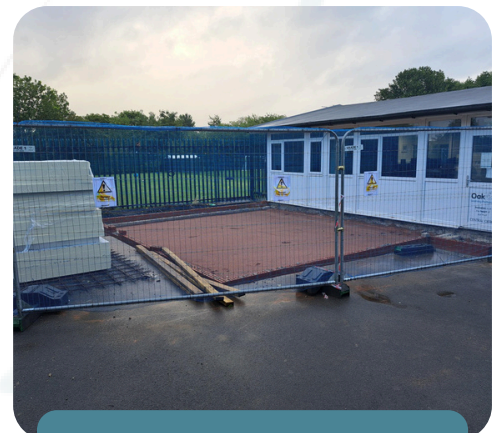
Central office progress